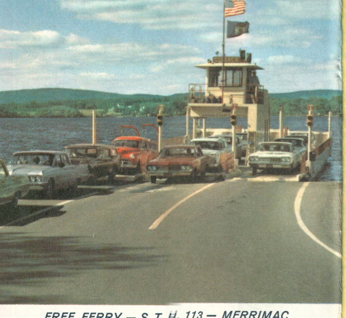
FREE FERRY - S. T. H. 113 - MERRIMAC

prepared by the STATE HIGHWAY COMMISSION FOR FREE DISTRIBUTION